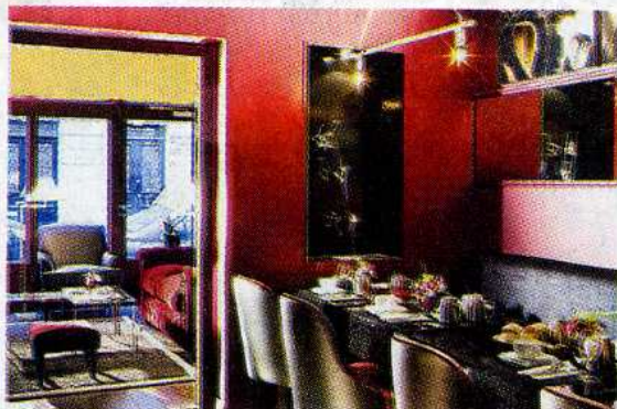
HÔTEL DES ACADÉMIES ET DES ARTS

But Chez Charlotte's real temptation may be its offering of macaroons made by the pastry chef Pierre Hermé, who has concocted such flavors as white truffle with grilled hazelnuts, chocolate and foie gras, wild